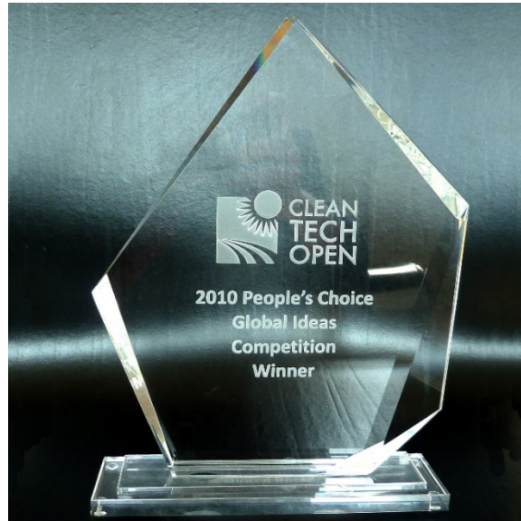
World Championship in Clean Technology won by the first author's start-up company Abeo in 2010.