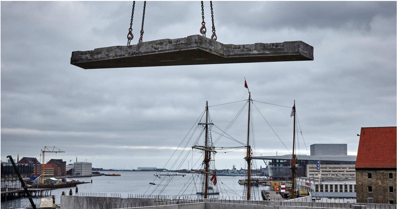
Super-light deck element at Krøyers Plads. Architect Cobe