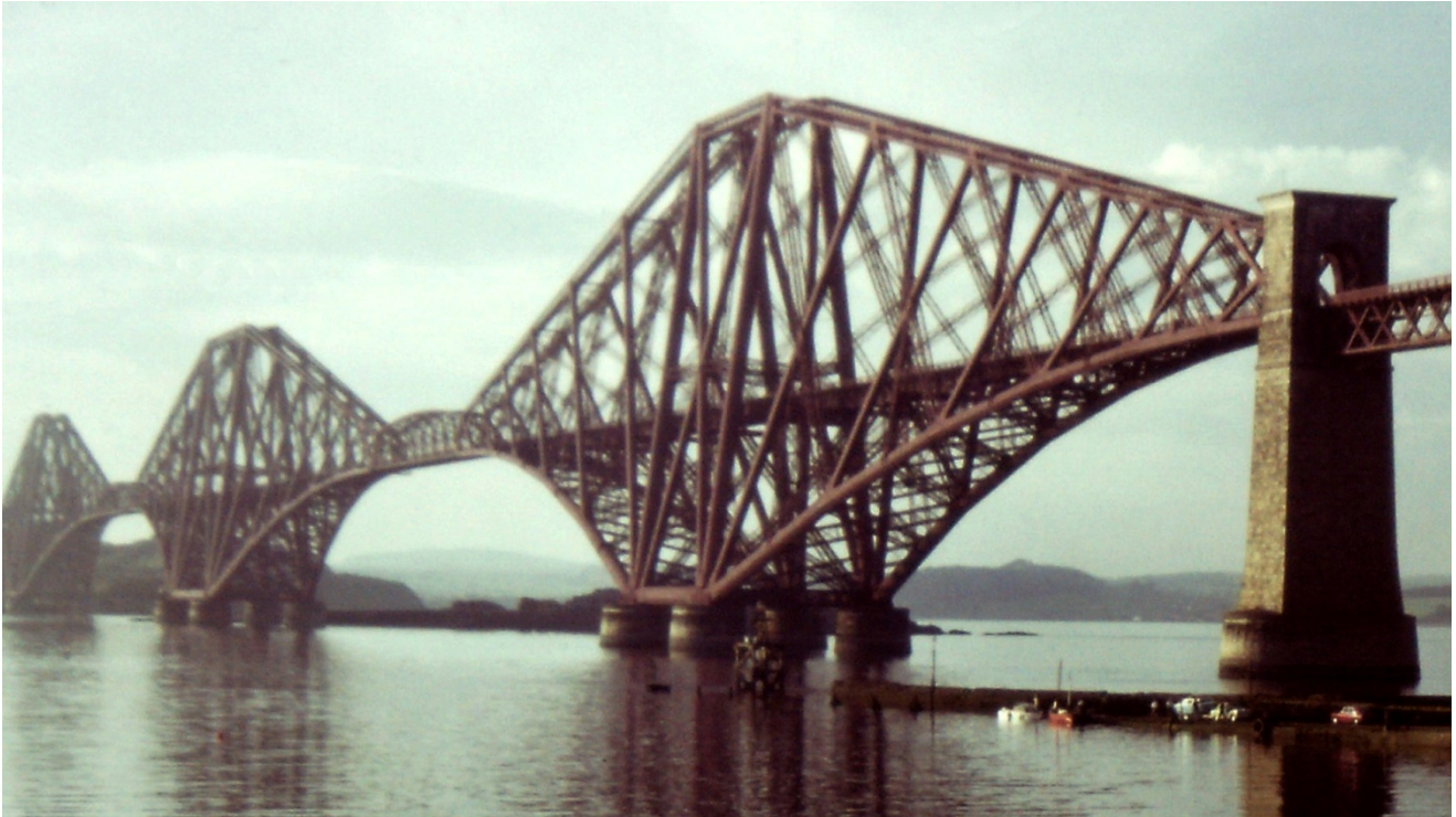
Firth of Forth Bridge by J. Fowler and B. Baker 1889